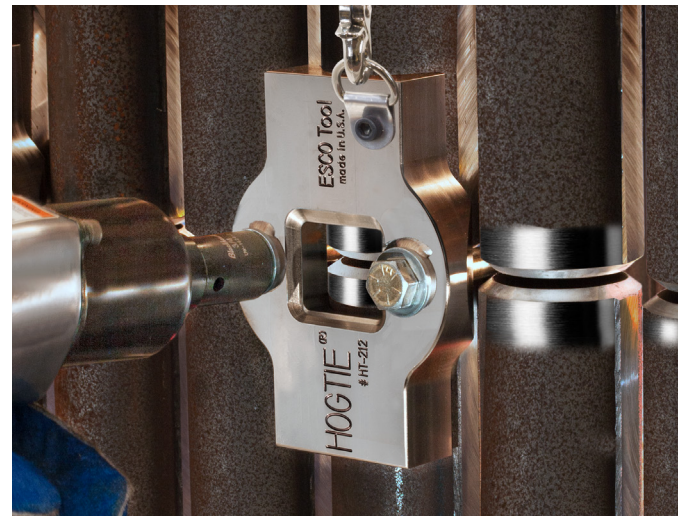
Available impact wrench draws the HOG TIE® assembly together for fast tube end alignment.