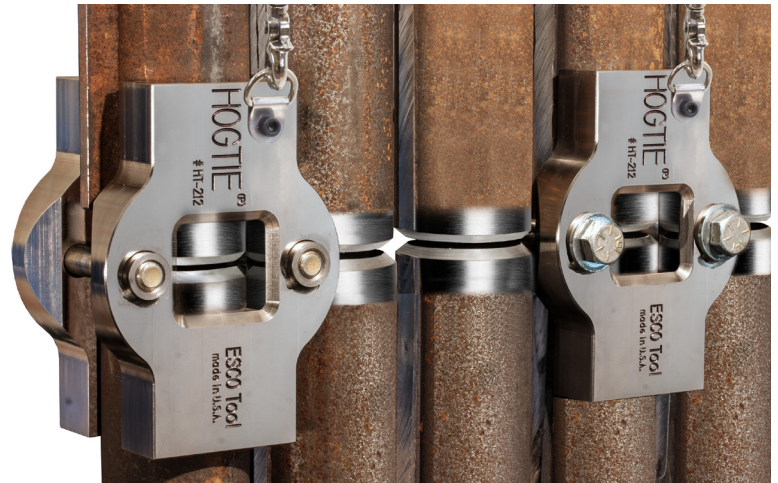
HOG TIE® tube alignment tools speed waterwall boiler tube fit-up and helps reduce tube joint failure due to misalignment.

The HOG TIE® alignment tool can also be used in other applications requiring accurate alignment for tube and pipe welding. It is made of precision machined high strength steel for long service and is available for tube sizes from 1.125" (28.6mm) O.D. to 3.250" (82.6mm) O.D.