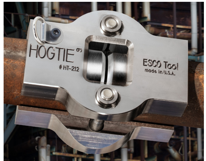
HOG TIE® assemblies are designed for use on boiler tube waterwall panels with 0.5" / 12.7mm wide membrane. For other pipe and tube applications please consult factory.