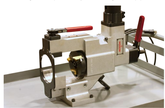
Rugged construction, low maintenance and easy to change tooling.