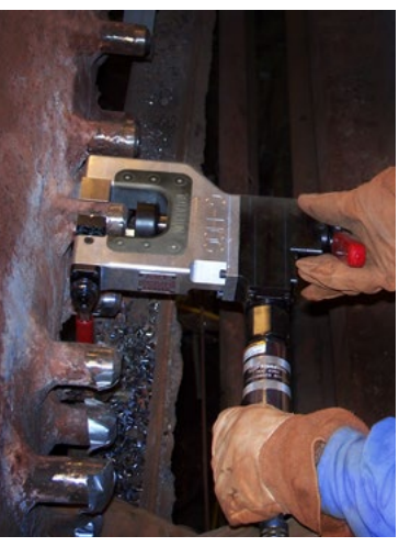
The C-HOG is ideally suited for beveling small bore heavy wall tubes with a high percentage of chrome, stainless steel and other hard alloys.