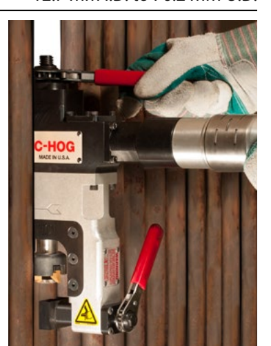
This rugged tool has a narrow profile and can fit between 1.25" O.D. membrane water wall boiler tubes to bevel a single tube for a Dutchmen tube repair.