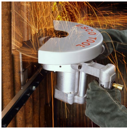
APS-438 Standard Boiler Tube Panel Saw