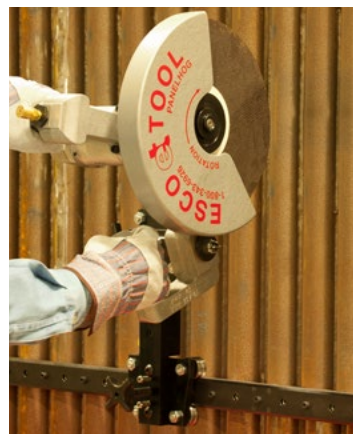
The APS-438 Saw moves up and down on the Vertical Track Attachment for cutting membrane from between boiler tubes and the attachment can be slid horizontal on the standard track for precise alignment. Two brakes, one on the APS-438 Saw and one on the Vertical Track Attachment enable secure and stable cutting.

Cut-Off Blades and Membrane Removal Blades