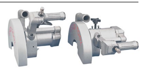
The Standard and Low Profile Boiler Tube Panel Saws